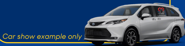
Car show example only