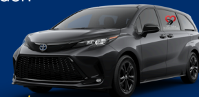
Car show example only